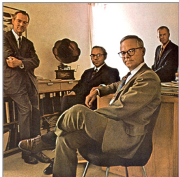
1955: First work on speech privacy – Bolt, Beranek, Newman & Cavanaugh